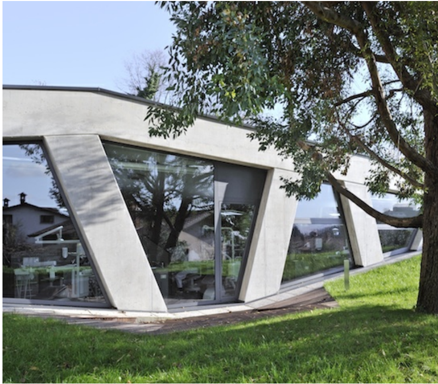
The building partly surrounded by an earth berm.

This also allows the building to integrate well into the predominantly residential environment. The green surfaces at the rear of the building seamless transition into its new green roof. The folded surface of the roof breaks up the building mass and marks the new entrance, which is separated from the house.